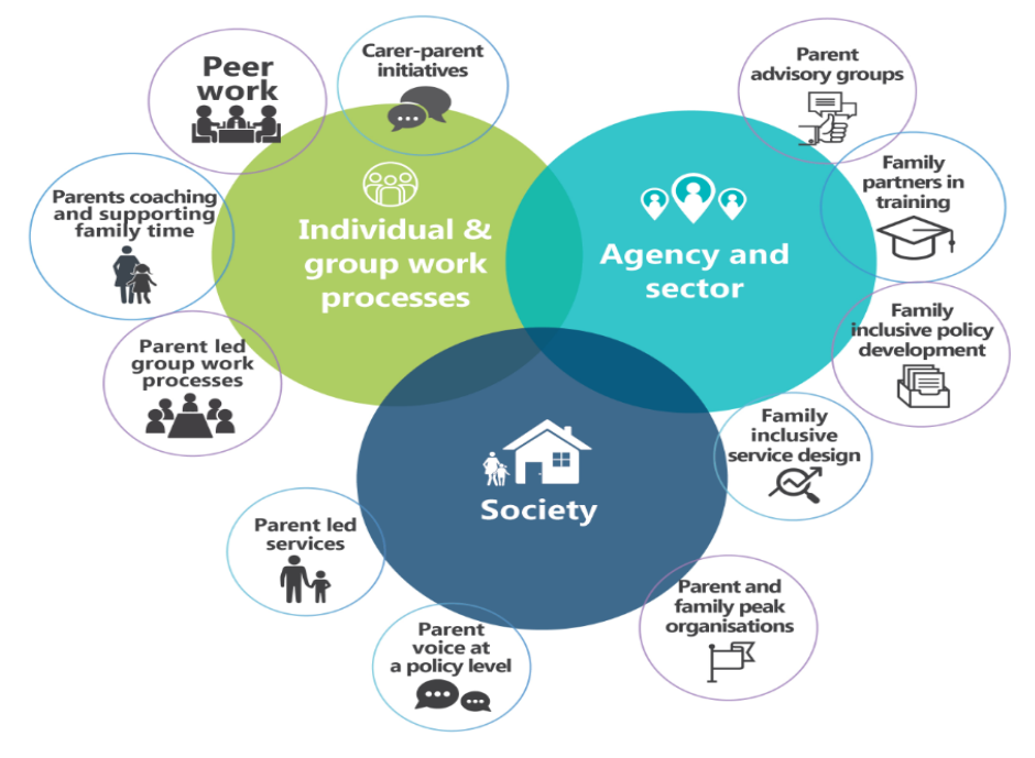
Figure four – integration of family inclusion into the child welfare system

I visited family inclusion initiatives integrated into the child welfare system at all levels and contexts including direct work with individual parents, agency culture change, research partnerships and community and social policy work as described in Figure four below. These initiatives can be operating anywhere on the spectrum of agency and parent led change in Figure three.